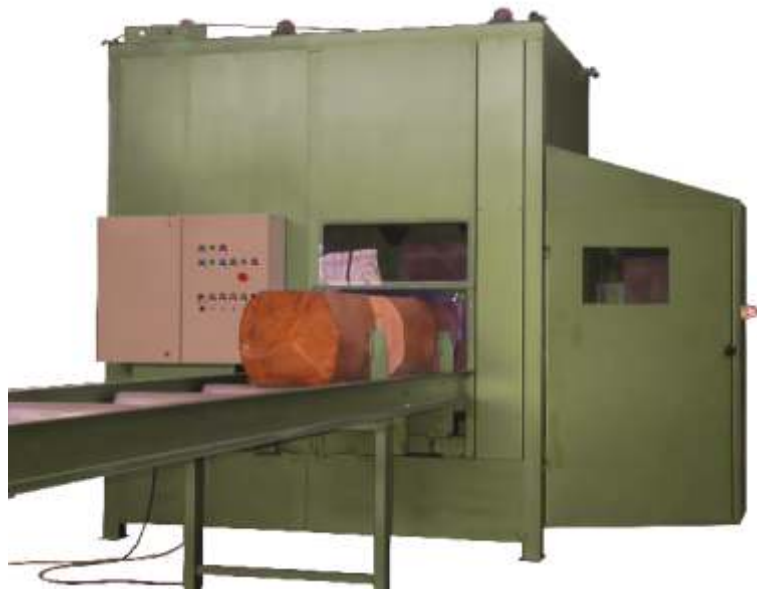
OZDW-600 machine tool for oblique corner notch cuts