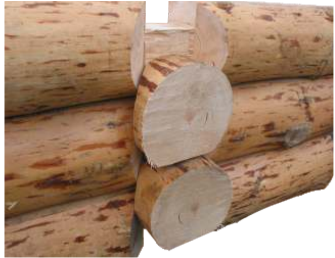
View of internal wall connection without remains.

The machine tool is designed for cutting oblique corner notches in round logs with flat cut based and in rectangular logs. This type of notch is characterized by its high tightness and the precise joint positioning. The machine tool cuts the notches with use of saws. This reduces the energy demand, when compared to milling operation. Average notch cutting time is 3 minutes.