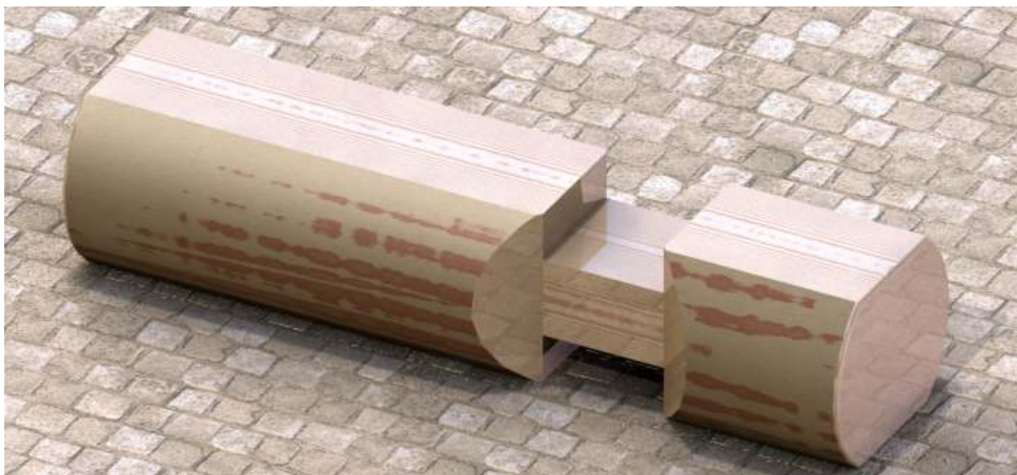
Two side-cut, barked log – ex ample of notch cut for connection of flange wall and internal division wall.