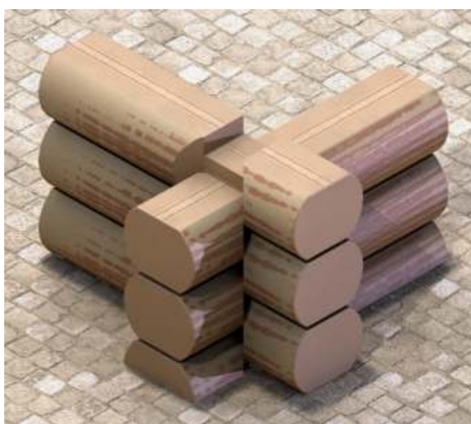
Corner of flange wall with slanted corner notches and dovetails.